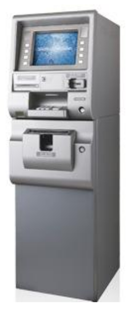
Hyosung Monimax 5000

The HALO ATM is slated for release in the fall of 2013.