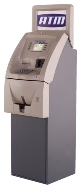
Triton RL 1600 ATM