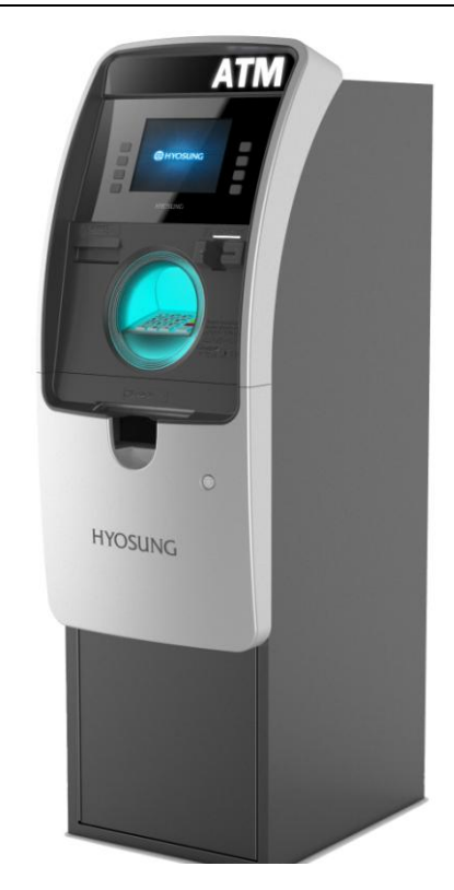
Hyosung Halo ATM

The new HALO ATM features a sleek new design inspired by the simple lines of Apple® products, a large 10" screen, an e-receipt option that uses QR codes and a custom application, and an improved lighting console designed to bring attention to the ATM machine.