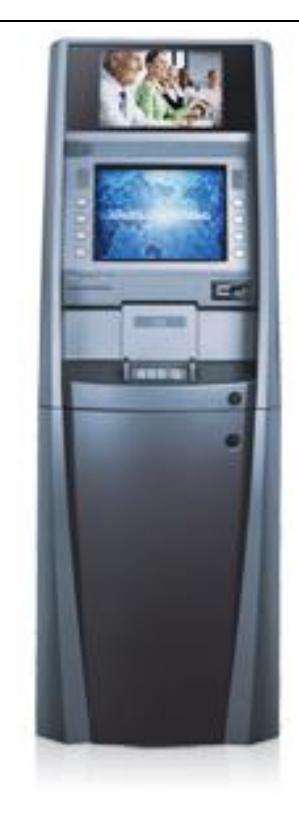
Hyosung Monimax 8000 ATM